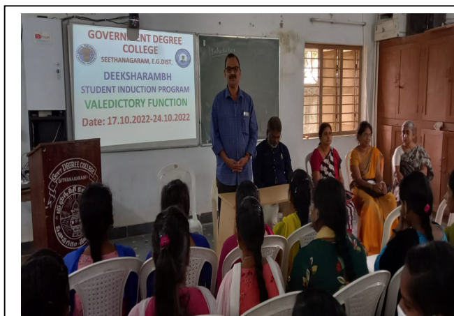
Deeksharambh- Valedictory Function 25 th October 2022