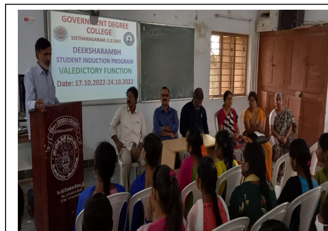
Deeksharambh- Valedictory Function 25 th October 2022