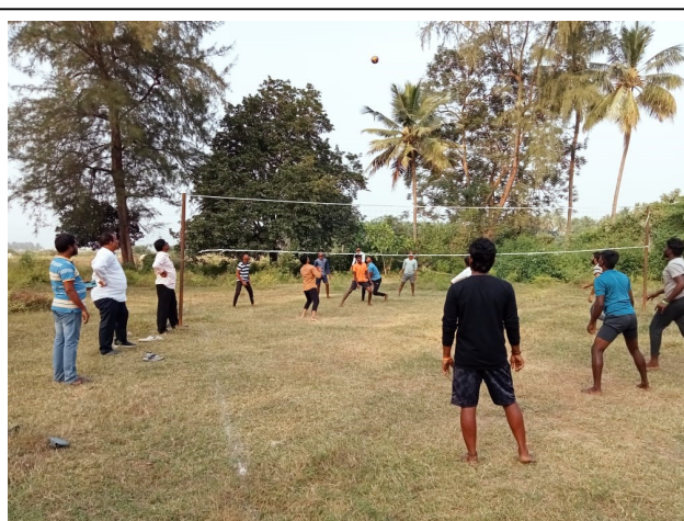
Students Participated in games