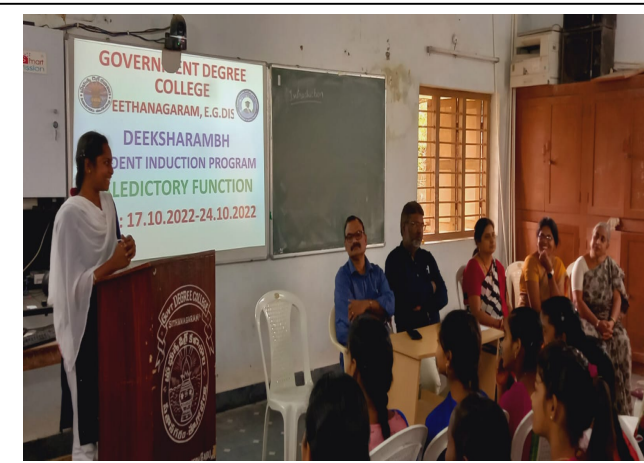
Students Feedback on Induction Program